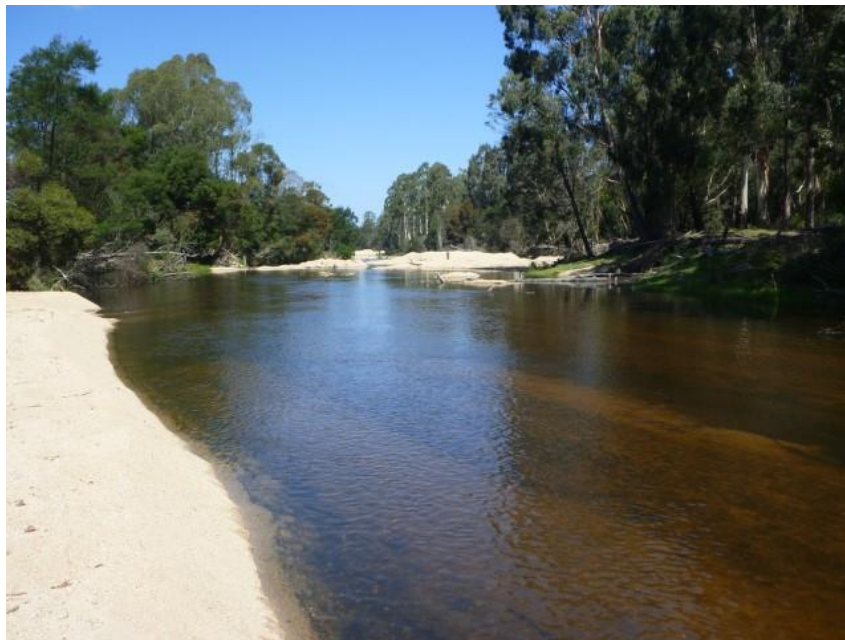
Cann River Floodplains

Willow control across the Cann River floodplain will conclude in the coming weeks, with a substantial amount of willows treated from Double Bridges to Gauge Track.