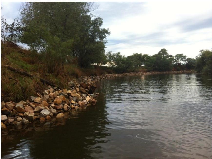
Lower Mitchell River Bank Stabilisation Works

1080 metres of rock beaching has been completed on the lower Mitchell River. Chemical willow control works will now take place at selected sites followed by mechanical removal of willows.