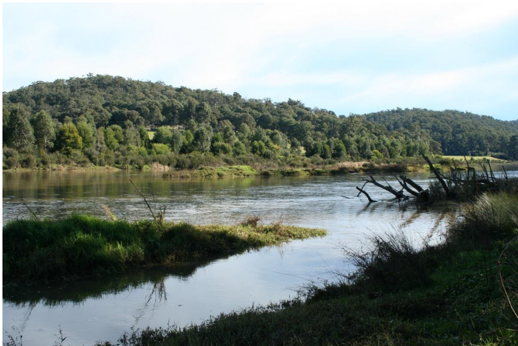
Snowy River at Jarrahmond

Scheduled for a start in December is an interagency project on Martins Creek. The aim of this project is to treat an isolated infestation of Tutsan Bush of approximately 15ha. This project will help to reduce the risk of Tutsan Bush establishing along Martins Creek and downstream on the Brodrigg River. The works will be carried out by East Gippsland Rainforest Conservation Management Network and funded by the EGCMA.