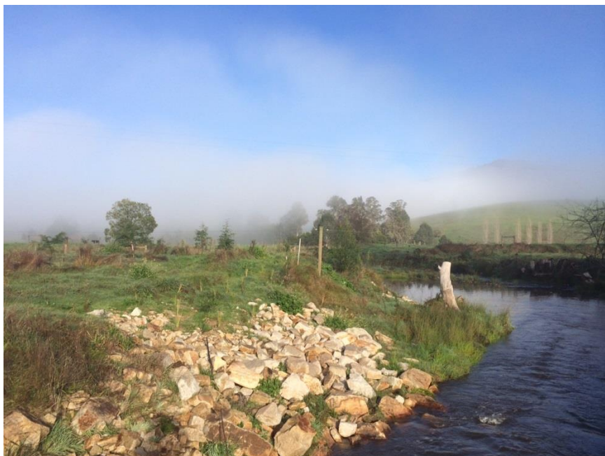
Combienbar River revegetation site

River rehabilitation works have commenced on the Combienbar River. This year the focus will be planting more native seedlings along the banks of the river and controlling willows throughout the valley. The willow control program will work closely with landholders to control juvenile willows and target mature willows. This year the willow control program aims at controlling 20ha of willows, a target which aligns with the East Gippsland Waterway Strategy (treating 100ha of priority woody weeds by 2022).